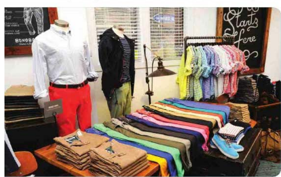
Online menswear retailer Bonobos is expanding its Guideshop store format.

Guideshop "guides" work one-on-one with customers during appointments, >