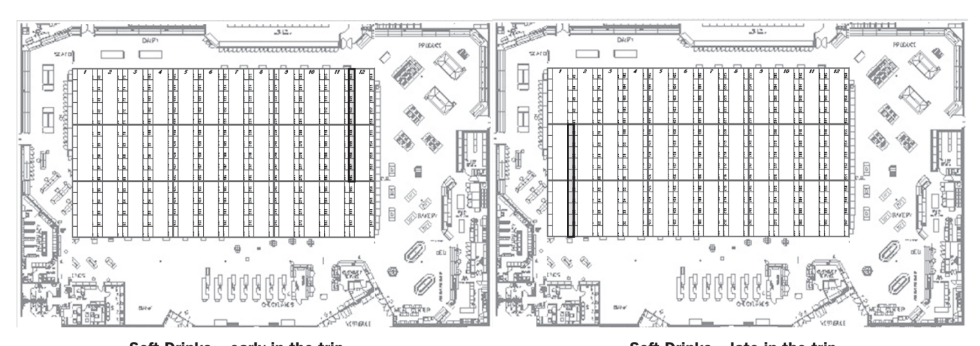
Soft Drinks - early in the trip